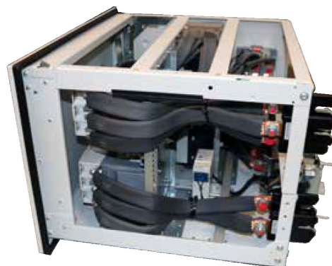
Connection: Between electrical components.