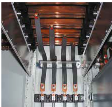
Connection: Busbar to busbar

Thus obtaining a contact surface that makes it possible to produce maintenance-free connections.