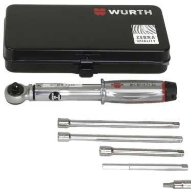
Assembly set for HSI 150-DG/HRK SSG