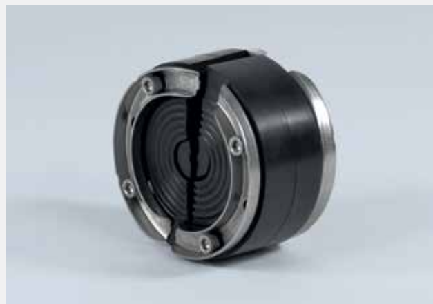
P-CABLE Basic SSG, article code: HSD 100-SSG 18-65

Cables or pipes of diameter 18 to 65 mm can be sealed with 12 segment rings. Thanks to the integrated blind plug, the P-CABLE Basic SSG is also suitable for closing reserve openings.