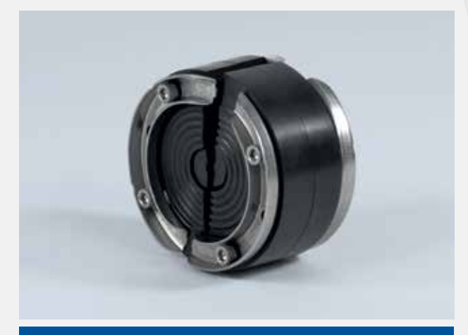
P-CABLE Basic SSG, article code: HSD 100-SSG 18-65

Cables or pipes of diameter 18 to 65 mm can be sealed with 12 segment rings. Thanks to the integrated blind plug, the P-CABLE Basic SSG is also suitable for closing reserve openings.