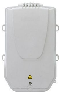
BUDI Fiber Optic Wall mount Enclosure, empty for holding FIST Splice Trays, with lock