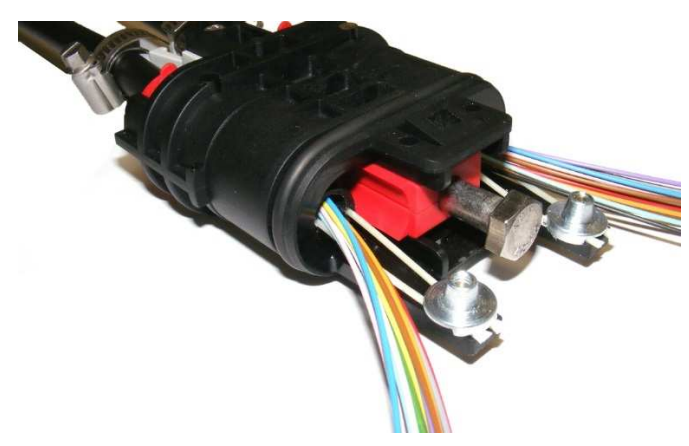
Double Ecam BPEO D6-18

As part of 3M's continued approach to simplify the BPEO closure portfolio and to promote gains in efficiency within FTTx deployments we have developed the fully mechanical ECAM D6-18.