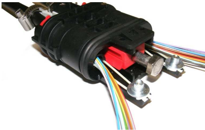
Double Ecam BPEO D6-18

As part of 3M's continued approach to simplify the BPEO closure portfolio and to promote gains in efficiency within FTTx deployments we have developed the fully mechanical ECAM D6-18 .