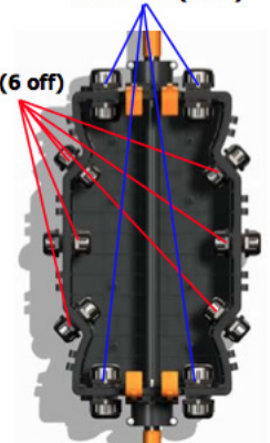
Side Ports (6 off)