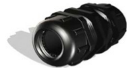
End Ports (4 off)

For Direct Buried Cables - The Gland size selected must be based on the Inner Sheath Diameter of the cable, as the Outer Sheath is removed before entering the closure to prevent water migrating along the cable between the 2 sheaths.