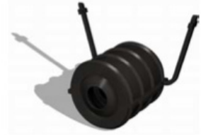
In Line Ports (2)

For Direct Buried Cables - The Seal size selected must be based on the Inner Sheath Diameter of the cable, as the Outer Sheath is removed before entering the closure to prevent water migrating along the cable between the 2 sheaths.