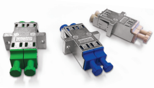
LC One Piece Duplex Adapters