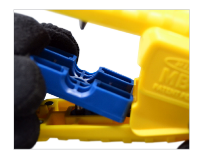
Magnetic trays accurately determine the appropriate blade depth & cable diameter to prevent damage.