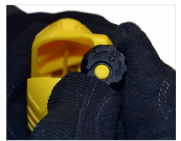
Recessed blade design & stowage lock provides safety & protects the blades while closed.