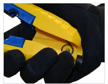
Low profile hinge & surface grip comfortably fit in hand for increased leverage & reduced fatigue.