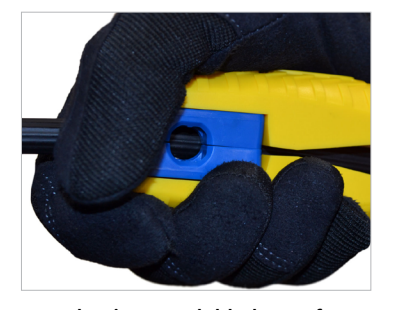
Long-lasting steel blade performs up to 5,000 cuts without dulling or reducing performance.