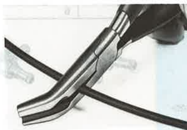
Cutting tubing to length