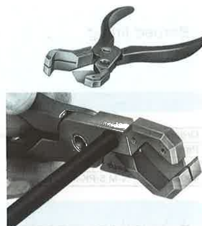
Chamfering alloy tube