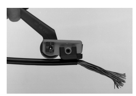
After adjustment (see instruction) insert the blade of the knife under the cable sheath.

It comes in a handy plastic case with two attachments for small-diameter cable slitting and an allen key to remove the cutter socket retention cap.