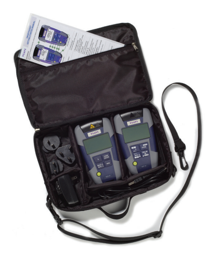
OMK-3x kit with light source, power meter, power supply, and USB cable.

Viavi OMK-3x optical test kits provide essential tools for power and insertion loss measurement and are ideal for a wide range of installation and maintenance applications.