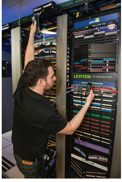
Reading FiberChek probe results on a smartphone