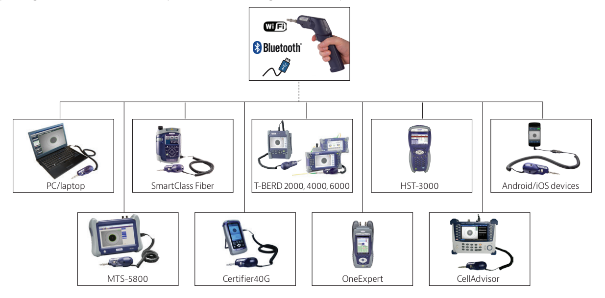
Connectable Viavi devices include: SmartClass™ Fiber family, T-BERD®/MTS family, OneExpert™ (ONX) family, CellAdvisor®, Certifier40G™, and MP-60 optical power meter

As an all-in-one inspection solution, the FiberChek probe rarely needs to connect to other devices. However, many technicians already use other devices as part of their testing and do not want to disrupt their existing workflows. That's why FiberChek integrates with other Viavi test devices to significantly improve productivity when you use them together. FiberChek can function independently of another test device, saving time by letting technicians test their next ports while an existing test is still in process.