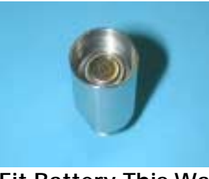
Fit Battery This Way Fig 5.1.1