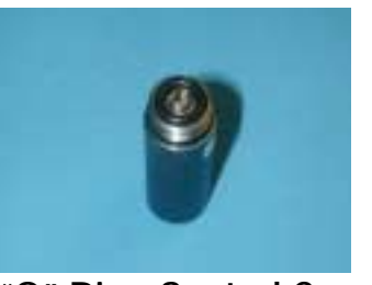
"O" Ring Seated Correctly Fig 5.1.2

Insert the shock absorber into the sonde body and press fully down to the front end.