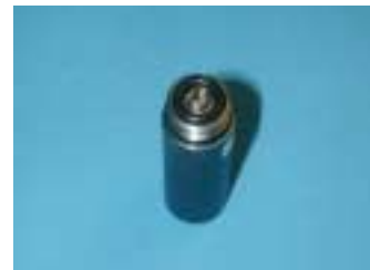
"O" Ring Seated Correctly Fig 5.1.2

Insert the shock absorber into the sonde body and press fully down to the front end.