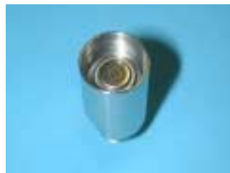
Fit Battery This Way Fig 5.1.1