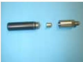
Electric Module Components

Check the battery condition of the electric module. Replace if necessary (see figure 5.1.1) ensure that "O" ring seal is fitted correctly (see fig 5.1.2). It is recommended that a spare battery is always available.