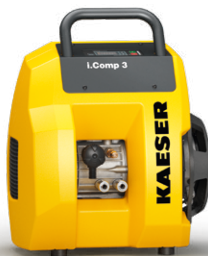
Fig.: i.Comp 3