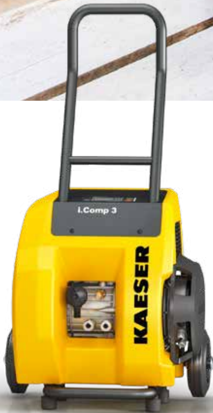
Fig.: i.Comp 3